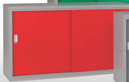
50kg shelf capacity (UDL) THIS MODEL ONLY