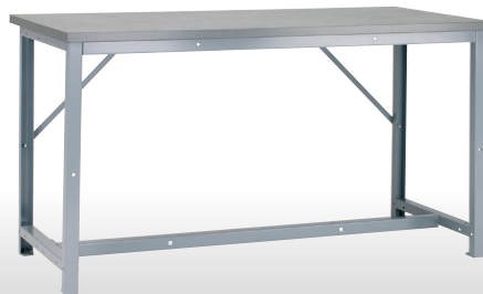
1500 x 600 c/w lino worktop PW156B

Simple flat pack assembly for a basic bench 600mm wide including all assembly fixings.