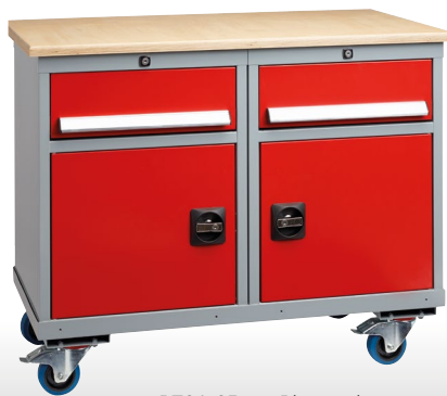
PT2A 25mm Plywood PT2B 25mm Plain MDF