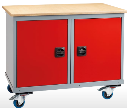
PT1A 25mm Plywood PT1B 25mm Plain MDF

To see the full range of colour options available for Premier Trolleys please visit www.jbedford.co.uk