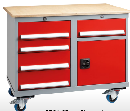
PT6A 25mm Plywood PT6B 25mm Plain MDF