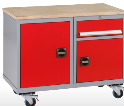
PT4A 25mm Plywood PT4B 25mm Plain MDF