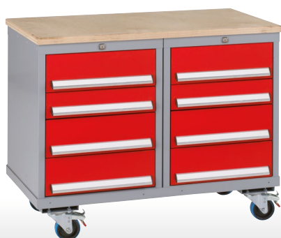
PT3A 25mm Plywood PT3B 25mm Plain MDF