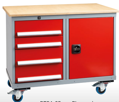
PT5A 25mm Plywood PT5B 25mm Plain MDF