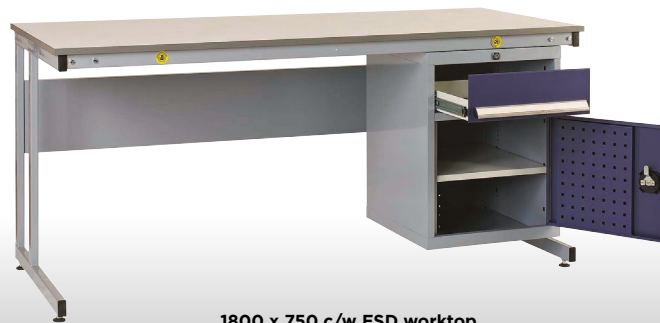
1800 x 750 c/w ESD worktop PW487G + PC2

Please note: Earth Bonding Points shown in image are an optional extra.