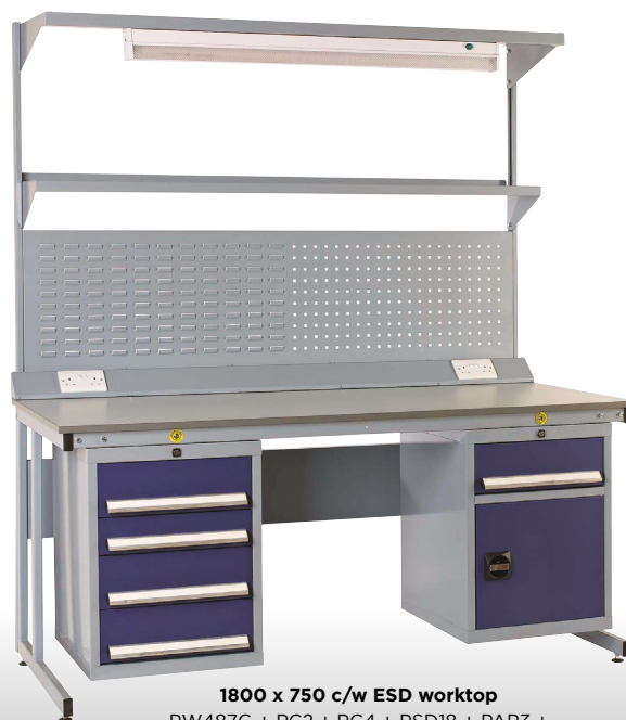
1800 x 750 c/w ESD worktop PW487G + PC2 + PC4 + PSD18 + PAP3 + PCP18 + PUSS18 + PLU18