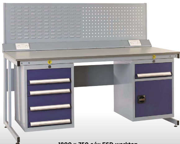
1800 x 750 c/w ESD worktop PW487G + PC2 + PC4 + PSD18 + PAP1 + PCP18

Please note: Earth Bonding Points shown in image are an optional extra.