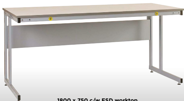
1800 x 750 c/w ESD worktop PW487G