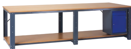
3000 x 1200 Starter workbench with MDF worktop, MDF base shelf and combined cabinet & drawer unit Order code: KDB3028BSA + CD1