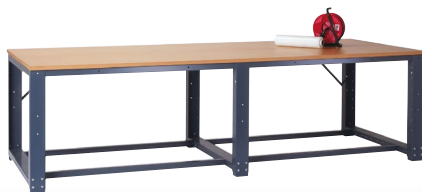
3000 x 1200 Starter workbench with MDF worktop Order code: KDB3028A