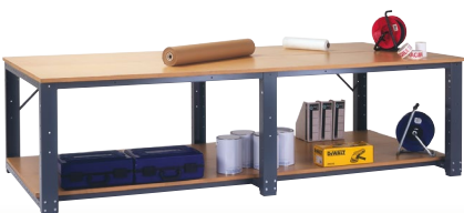
3000 x 1200 Starter workbench with MDF worktop and MDF base shelf Order code: KDB3028BSA