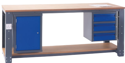
2000 x 700 Starter workbench with MDF worktop, MDF base shelf, cabinet, triple drawer & leg socket Order code: KDB2078BSA +C1 +D3 +LS1

ECONOMIC: This system offers great economic advantages over standard workbench sizes e.g. the 3000mm x 1200mm workbench (opposite) is the equivalent working area of 4 x 1500mm x 600mm workbenches.