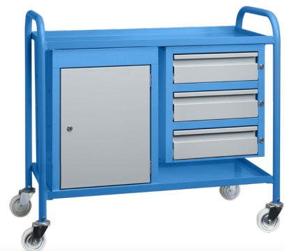
Fully welded 2 tier all steel trolley with triple drawer and cabinet Order code: GP5