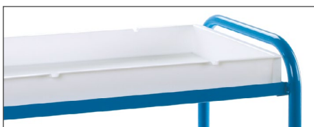
Plastic Tray - 25kg UDL