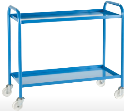
Fully welded all steel 2 tier trolley Order code: GP1