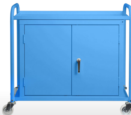
Fully welded all steel 2 tier trolley with double doors Order code: GP4

Visit www.jbedford.co.uk for exclusive online products and colour options