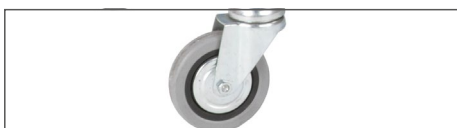
Rubber Tyre Castors (150kg UDL)