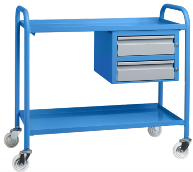
Fully welded all steel 2 tier trolley with double drawer Order code: GP2