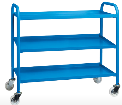
Fully welded all steel 3 tier trolley Order code: GP3