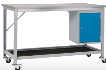
1500 x 700 c/w lino worktop EW157B + C1 + PW157BM + PW4SC