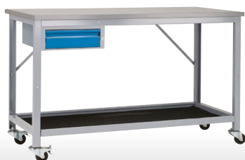
1500 x 700 c/w lino worktop EW157B + D1 + PW157BM + PW4SC