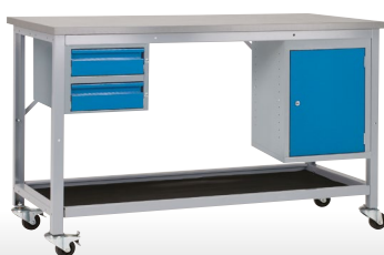
1500 x 700 c/w lino worktop EW157B + C1 + D2 + PW157BM + PW4SC