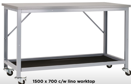
1500 x 700 c/w lino worktop EW157B + PW157BM + PW4SC

Take your workbench to the job with a mobile version of the economy workbench system.