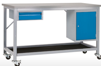
1500 x 700 c/w lino worktop EW157B + D1 + C1 + PW157BM + PW4SC