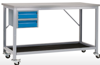
1500 x 700 c/w lino worktop EW157B + D2 + PW157BM + PW4SC