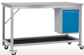
1500 x 700 c/w lino worktop EW157B + CD1 + PW157BM + PW4SC