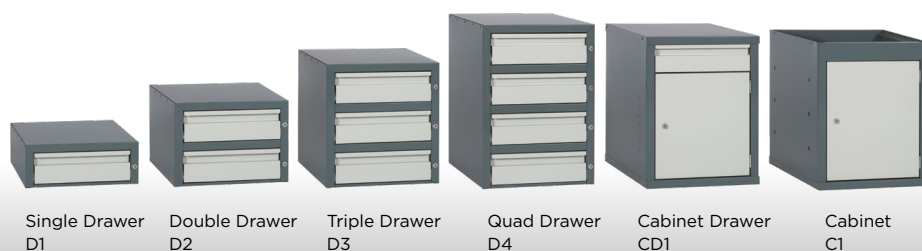
Single Drawer D1