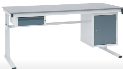
1800 x 750 c/w lino worktop 48187D + D1 + C1

300mm of smooth height adjustment from 700-1000