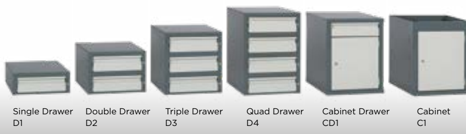
Single Drawer D1 Double Drawer D2 Triple Drawer D3 Quad Drawer D4 Cabinet Drawer CD1 Cabinet C1