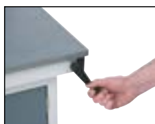
300mm of smooth height adjustment from 700-1000