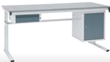
1800 x 750 c/w lino worktop 48187D + D1 + C1