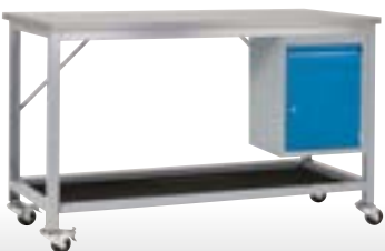
1500 x 700 c/w lino worktop EW157B + CD1 + PW157BM + PW4SC