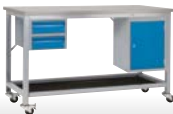
1500 x 700 c/w lino worktop EW157B + C1 + D2 + PW157BM + PW4SC