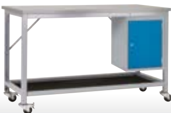
1500 x 700 c/w lino worktop EW157B + C1 + PW157BM + PW4SC