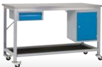
1500 x 700 c/w lino worktop EW157B + D1 + C1 + PW157BM + PW4SC