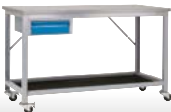
1500 x 700 c/w lino worktop EW157B + D1 + PW157BM + PW4SC