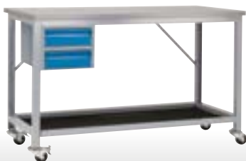
1500 x 700 c/w lino worktop EW157B + D2 + PW157BM + PW4SC