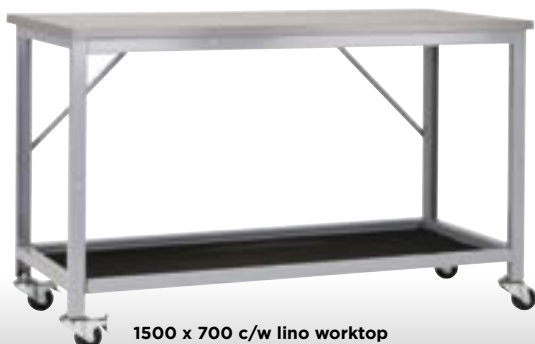
1500 x 700 c/w lino worktop EW157B + PW157BM + PW4SC

Take your workbench to the job with a mobile version of the economy workbench system.